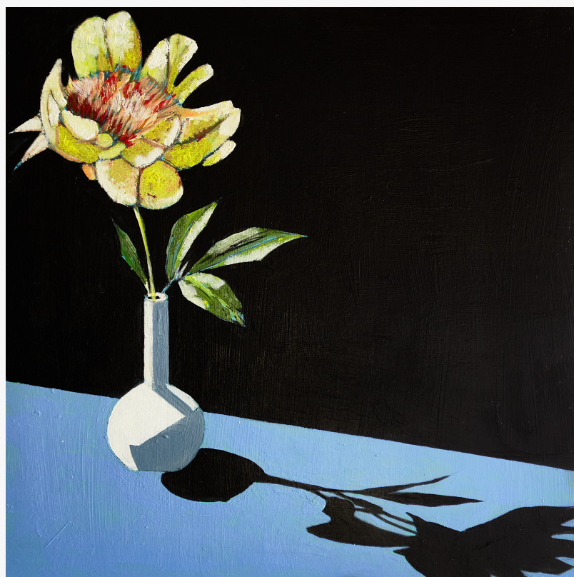
Art By Don Hershman