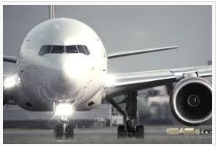
Aircraft waiting for FAMs to board

The dubious deployments of air marshals to the border while the DHS Secretary warns of additional attacks on the homeland is causing a revolt of sorts within the air marshal community. What's compounding the issue is apparently not enough air marshals have volunteered for the border duty so the agency has threatened its workforce with termination if they don't deploy.