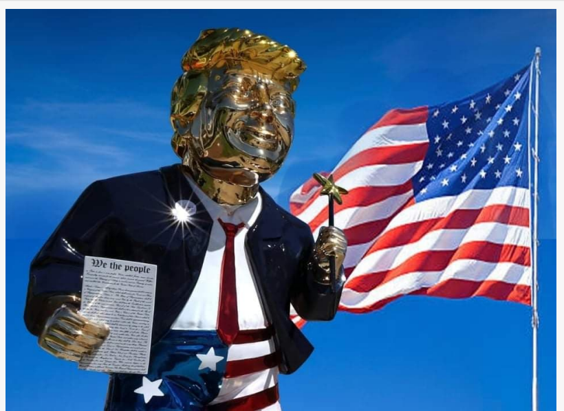
Trump Statue and the American Flag