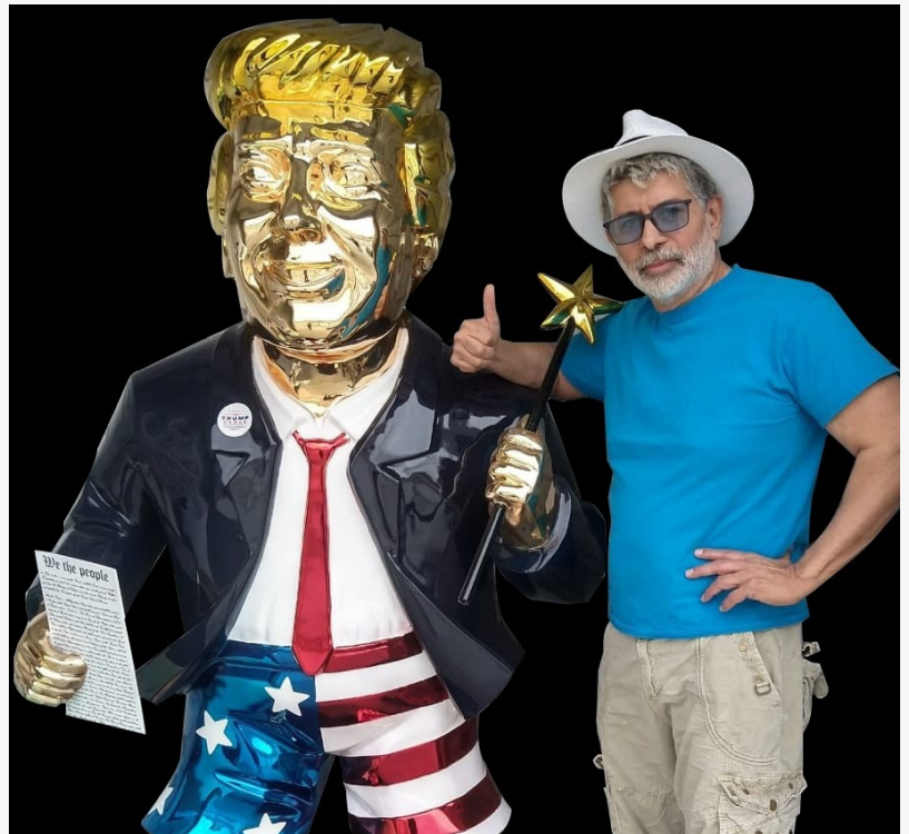
Trump Statue and Jose Mauricio Mendoza

This press release can be viewed online at: https://www.einpresswire.com/article/578689839