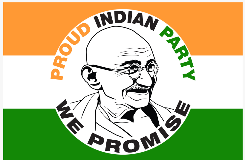
Proud Indian Party