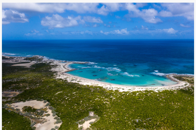
Development opportunity of a lifetime

Sotheby's Concierge Auctions is the world's largest luxury real estate auction marketplace, with a state-of-the-art digital marketing, property preview, and bidding platform. The firm matches sellers of one-of-a-kind homes with some of the most capable property connoisseurs on the planet. Sellers gain unmatched reach, speed, and certainty. Buyers receive curated opportunities. Agents earn their commission in 30 days. In November 2021, the firm was acquired by Sotheby's, the world's premier destination for fine art and luxury goods, and Anywhere Real Estate INC (NYSE: HOUS), the largest full-service residential real estate services company in the United States, holding a joint 80 percent ownership stake. Sotheby's Concierge Auctions continues to operate independently, partnering with real estate agents affiliated with many of the industry's leading brokerages to host luxury auctions for clients. Since Sotheby's Concierge Auctions' inception in 2008, it has generated billions of dollars in sales, broken world records for the highest-priced homes ever sold at auction and conducted auctions in 46 U.S. states and 32 countries. The firm owns one of the most comprehensive and intelligent databases of high-net-worth real estate buyers and sellers in the industry, and it has committed to build more than 300 homes through its Key For Key® giving program in partnership with Giveback Homes™, which guarantees that for every property the company sells, a new home is