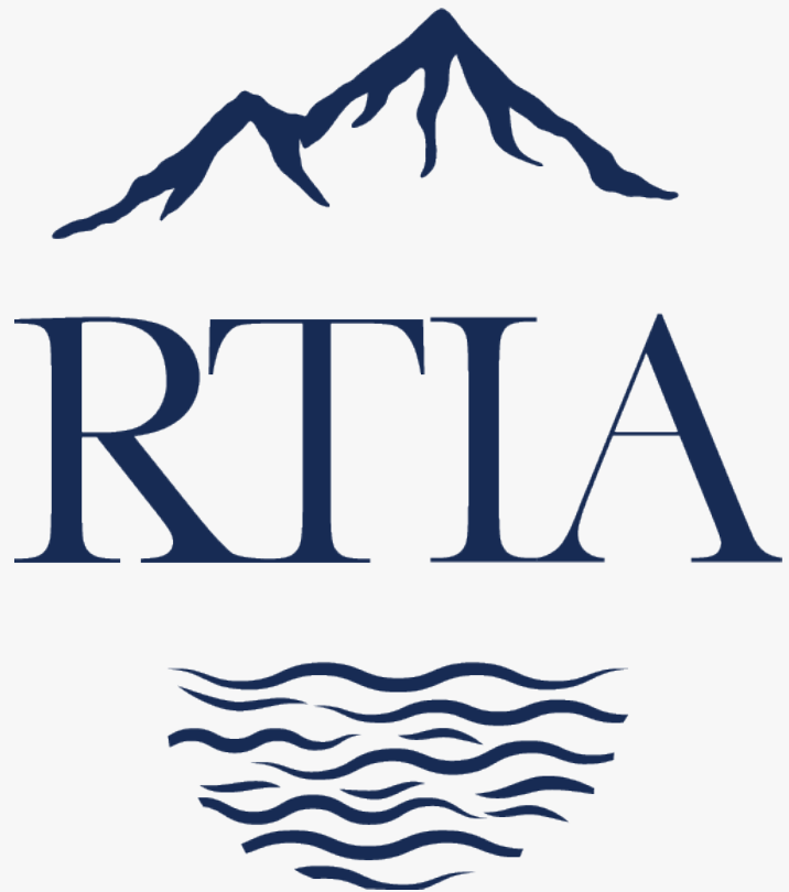
Reno Tahoe International Art Show