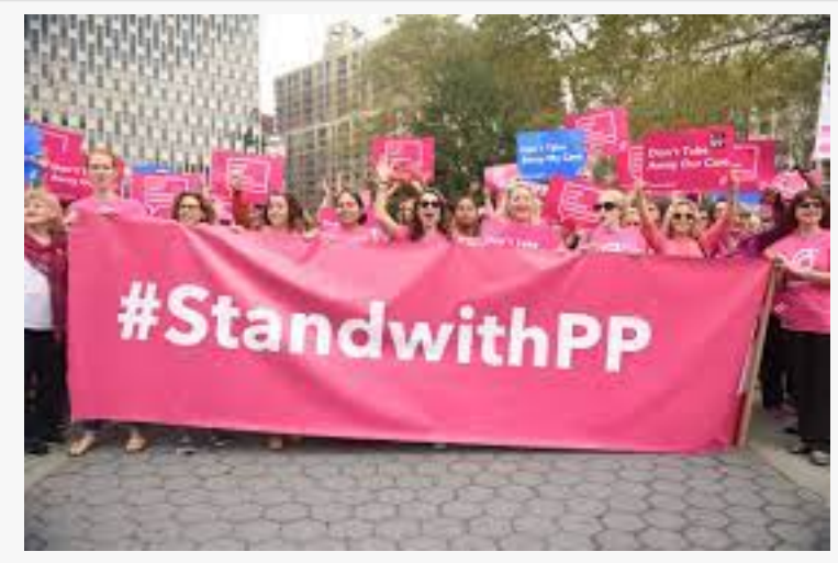
Planned Parenthood Activists Mailing List

Currently, Sprint Data Solutions Worldwide Marketing has extended its service range well past its initial limit of the hometown of Las Vegas, Nevada. The rest of the United States is now covered, including Alaska and Hawaii. Complete North American service is also available, with lists for the markets in Canada and Mexico. For organizations that want to reach out internationally, lists are also available that cross the Atlantic and provide targeting for the European Union markets, such as France.