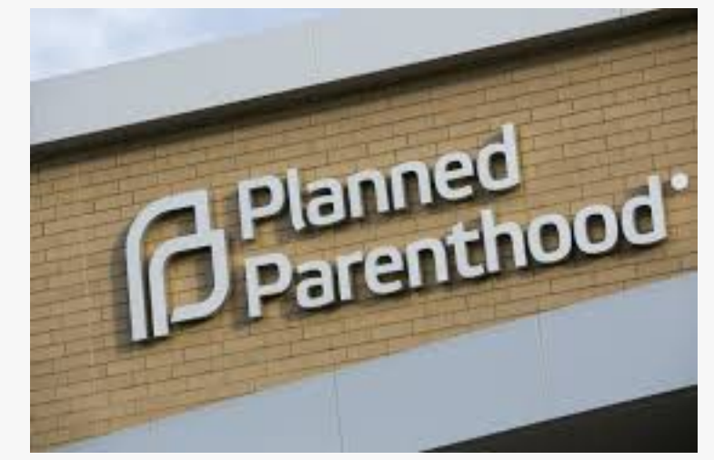
Planned Parenthood Offices Mailing List