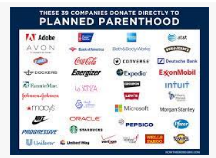
Plannedc Parenthood Corporate Donors Mailing

Other organizations set their sights on the general public. With these groups, consumer postal mailing lists are a better option. These listings are classified according to both geographic and demographic requirements. Whether it's a B2B or consumer retail focus, Sprint Data Solutions Worldwide Marketing can help organizations find the market they are most interested in.