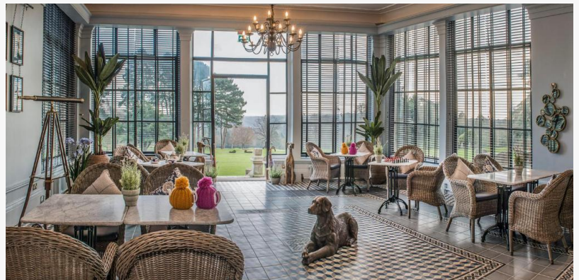
Orangery Selsdon Park

Selsdon Mansion was once an Anglo-Saxon hall, a medieval estate of the Knights Templar, a Tudor and Elizabethan manor house and a Victorian country seat and today a stunning luxury hotel.