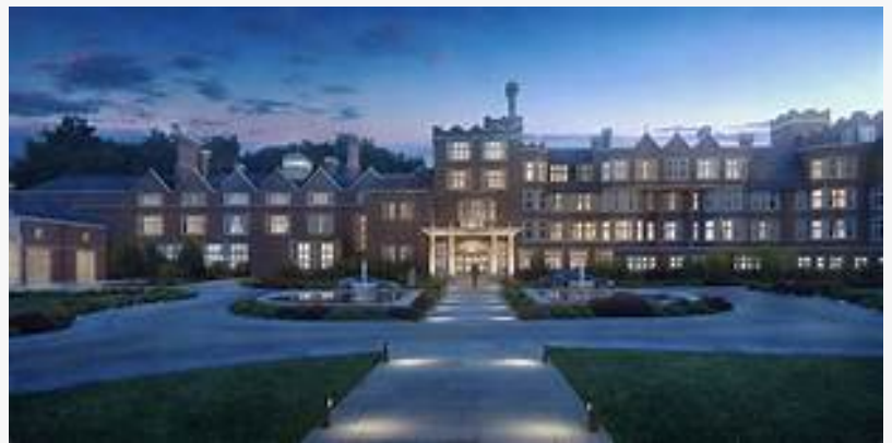
Selsdon Park Auction