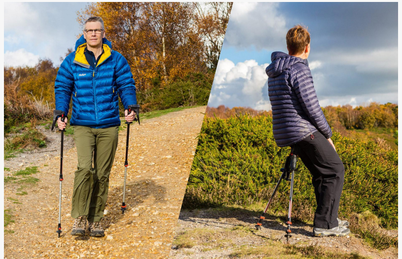
SeatStix In action