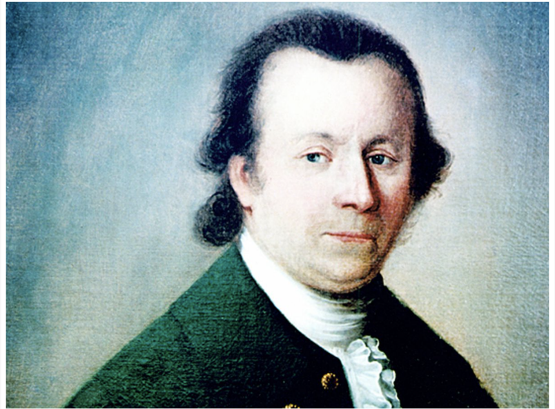
Button Gwinnett represented Georgia at the First Continental Congress in 1776. He was the first of the Declaration of Independence signatories to die, one year later, in a duel with a rival.