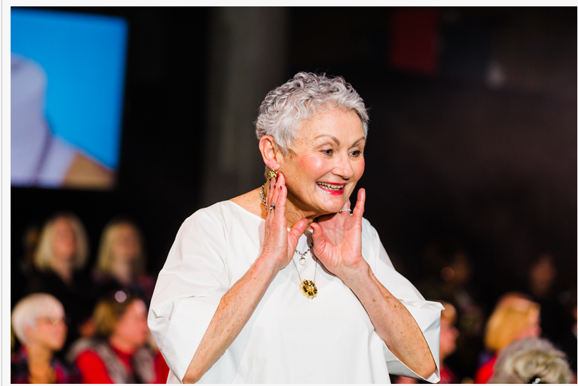
A model showcases her jewelry at a past Sabika Jewelry Fashion Show.

This press release can be viewed online at: https://www.einpresswire.com/article/578879560