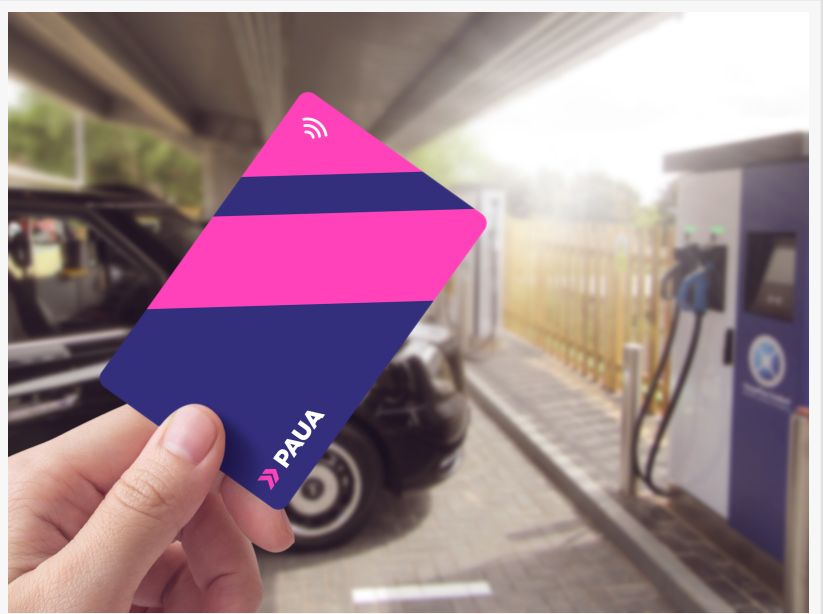
Paua EV Charge card ready for use on ChargePlace Scotland

ChargePlace Scotland (CPS) can confirm that it has partnered with market leading EV fleet fuel card provider Paua to provide a roaming solution for the Great British EV Rally in July this year. This is the first step in what could become a long-term partnership with CPS, enabling business drivers using the Paua platform to access multiple Scottish charging networks via a single solution that can take them from Lerwick to Berwick.