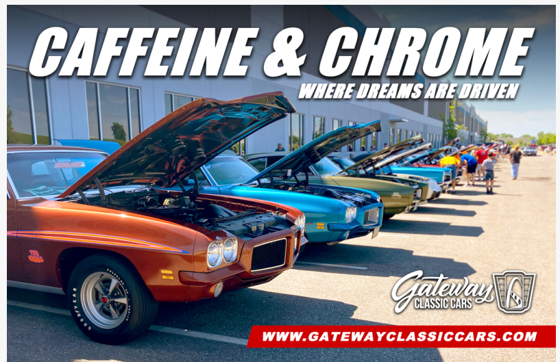
Gateway Classic Cars Caffeine & Chrome