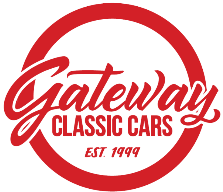
Gateway Classic Cars Circle Logo

Austin is renowned as "Bat City" for its Congress Avenue Bridge is the largest urban bat colony in the world where roughly 1.5 million Mexican free-tailed bats roost. Sightseers are attracted to the bridge at dusk to see hundreds of thousands of bats take to the sky to feed. On summer nights, visitors can perch on the bridge or the nearby riverbanks to witness the spectacle. There are even boat tours that provide a unique perspective.