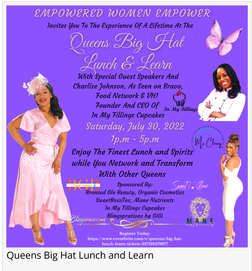
Queens Big Hat Lunch and Learn