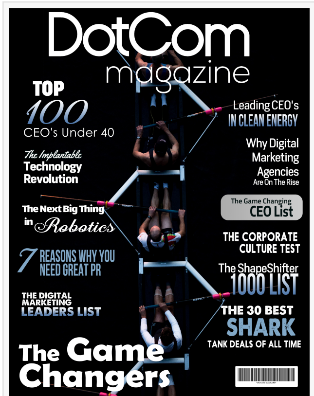
The DotCom Magazine Game Changers Edition

DotCom Magazine is a leading news and marketing platform providing fascinating interviews with news makers, thought leaders, and entrepreneurs. DotCom Magazine is the leader in putting people