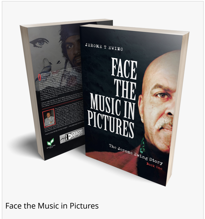
Face the Music in Pictures

PALATINE, IL, UNITED STATES, July 21, 2022 /EINPresswire.com/ -- " Face the Music in Pictures ": a remarkable piece of work designed to inspire everyone. This enthralling book encourages readers of all ages to live their best lives, covering a period way before the "best life" anthem was recorded. The book inspires readers to follow their dreams, to keep God first, and to never give up while en route to their dreams. Such themes don't just resonate; they also become the golden glue that guides the story along like the magic needle that guides your favorite album along its way to sonic perfection. And