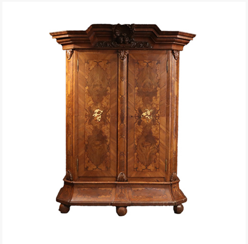
German 18th century Baroque carved and inlaid walnut armoire.