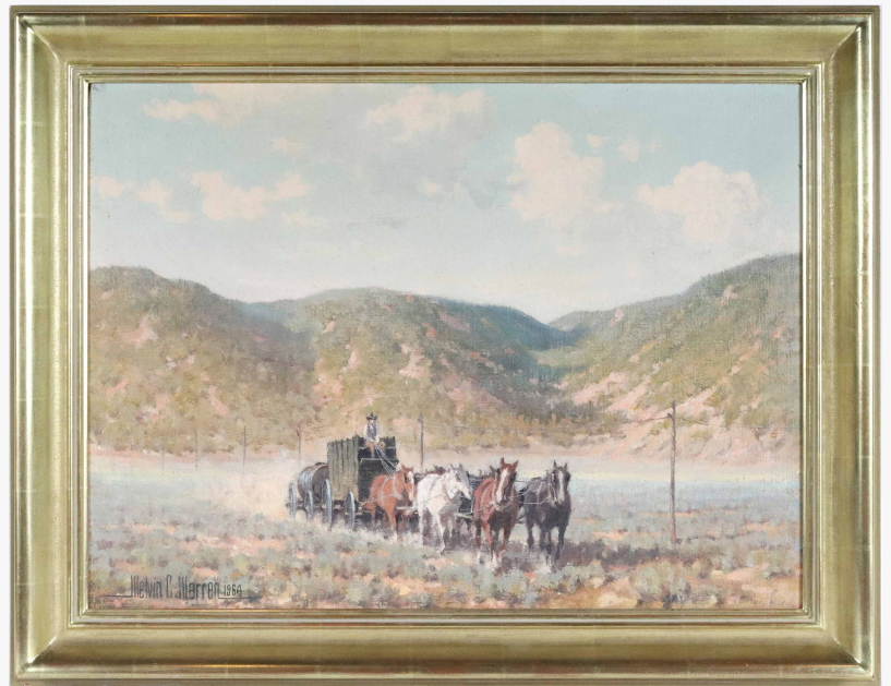
Oil on canvas of Melvin B. Warren's Supply Train (1964) that was acquired in Switzerland.