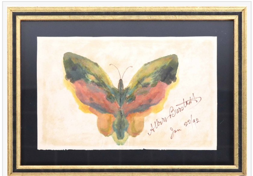
Watercolor painting by Albert Bierstadt (German-American, 1830-1902), titled Butterfly, dated "Jun 22/92".

A renowned New York City psychologist's estate is included in the auction and includes a remarkable pair of Italian painted and carved angels gifted to the consignor from his close friend Gloria Vanderbilt. One of her pieces of art, a collage, is included in the sale, along with a pair of Ionic columns and some European paintings.