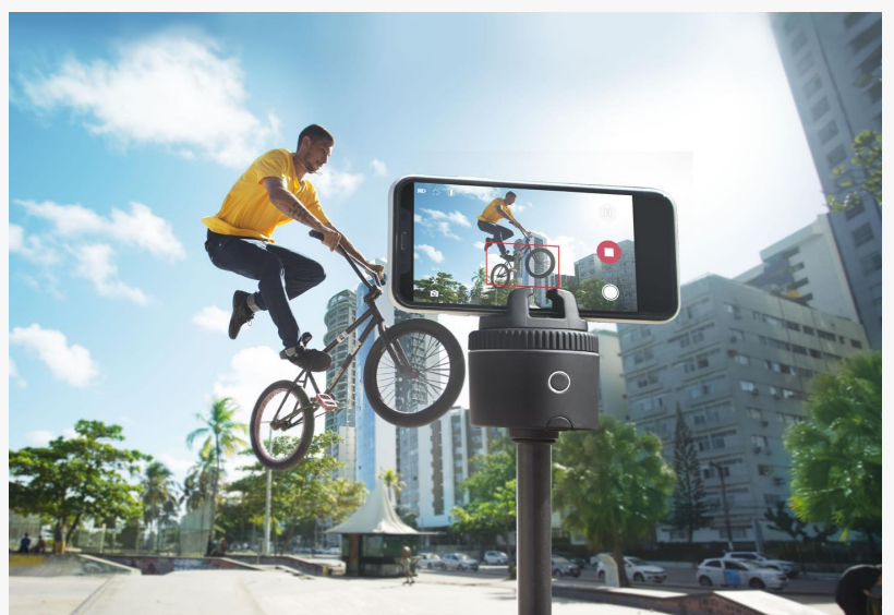
Submit Your Coolest Video to Win Big

LOS ANGELES, CA, UNITED STATES, June 30, 2022 /EINPresswire.com/ -- Pivo, Inc. , a leading developer of AI-technology solutions for content creators, has announced The Pivo $5k Challenge which rewards up to $5,000 in cash and prizes to consumers who share their best videos and images. The company will be accepting submissions to the $5k Challenge from July 1st – July 31st, 2022.