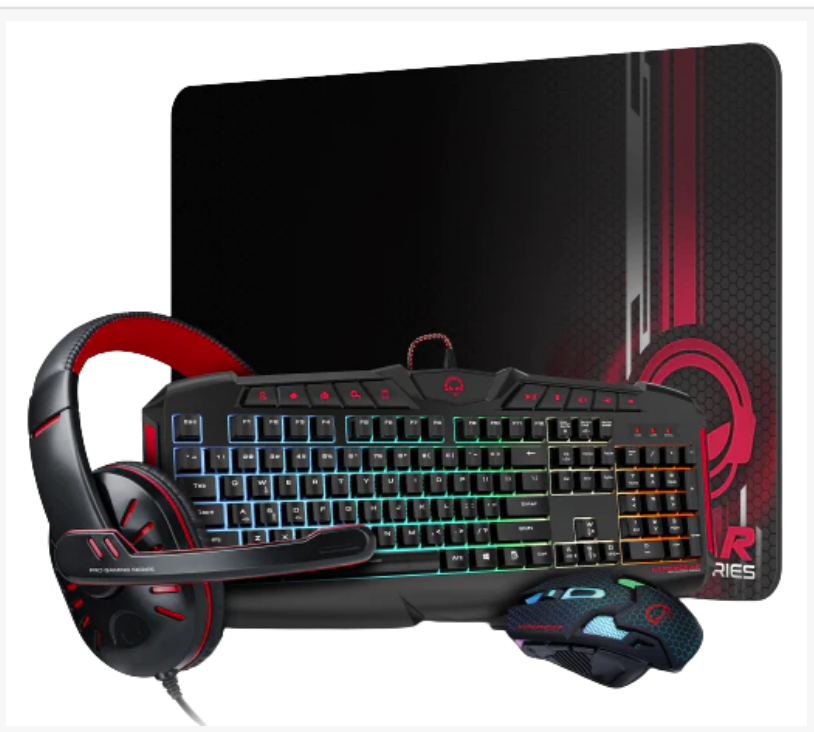
HyperGear 4-in-1 Gaming Kit Red Dragon

HyperGear's CobraStrike True Wireless Gaming Earbuds offer pro-grade advantages in a pocket-sized form. Highlights include 3D positional sound, lagless low-latency synchronized audio, a background-filtering mic, and longlasting battery life. These earbuds are perfect for playing mobile or for those