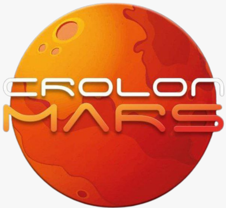
Crolon Mars Logo

Unique one of a kind NFT's including Mutant Apes, Astronauts, Aliens and Ufology. Created by a selection of exceptional artists from around the world. These extraordinary collections will be sure to explode onto the Cronos blockchain. Owners will be able to trade there NFT's on a rapidly increasing market which continues to grow substantially each year. Although holding onto the CROLON NFT may be the wisest decision ever made!