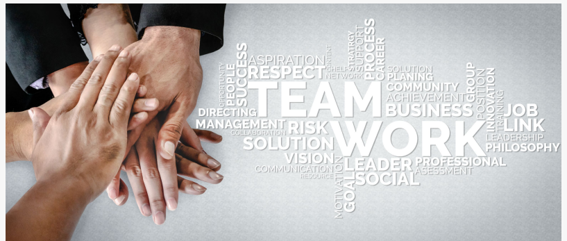
Women Helping Women Helps Everyone

This press release can be viewed online at: https://www.einpresswire.com/article/579389430