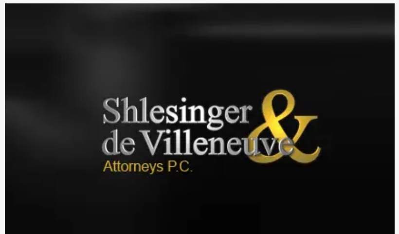
Shlesinger & deVilleneuve Attorneys, P.C.