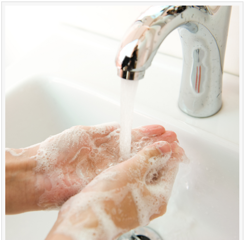
Essential to prevent infections