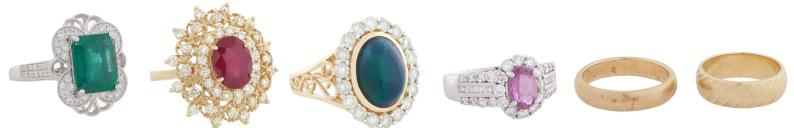
The large selection of jewelry will include diamonds, tanzanites, emeralds, opals, a tennis bracelet and more.