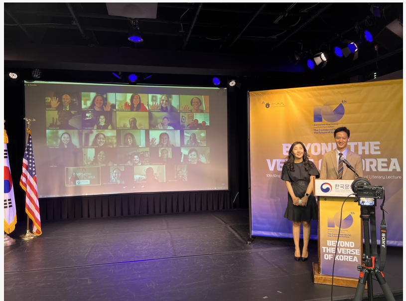
BEYOND THE VERSE OF KOREA (Zoom Session)