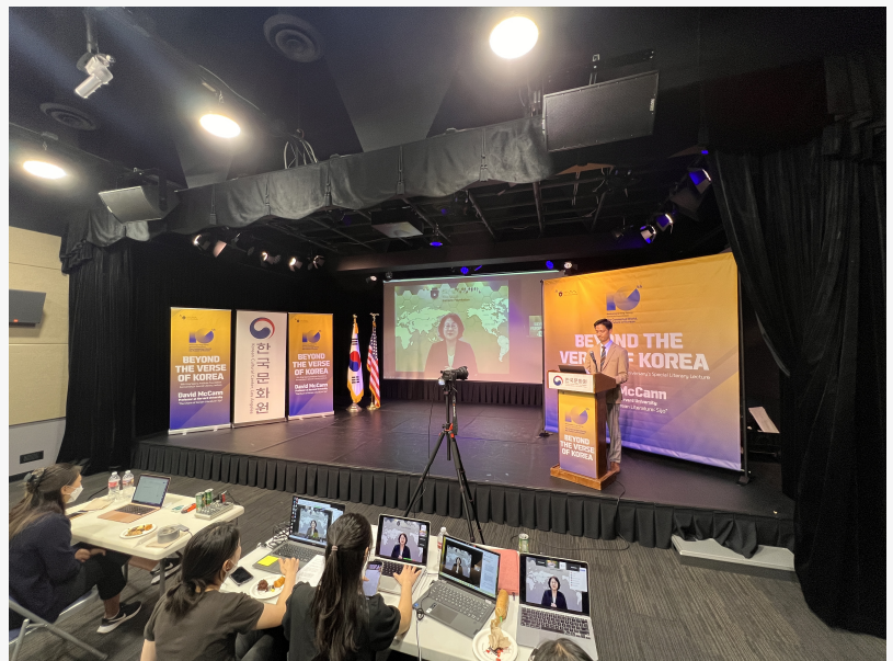
Live zoom session on-site