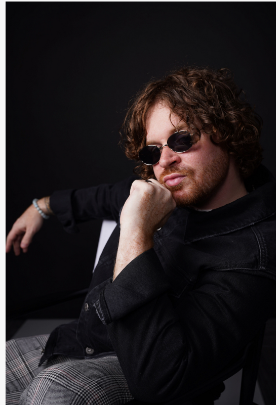
Forbes 30 Under 30 Nominee