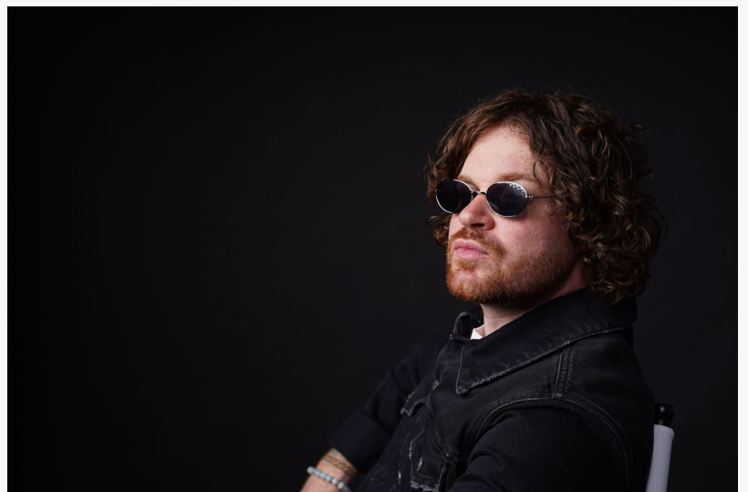
Forbes 30 Under 30 Nominee