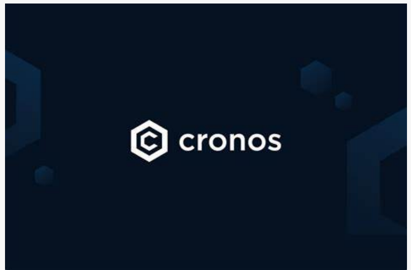
The Cronos Blockchain

Crolon Mars launched on the Cronos Chain (The blockchain owned by Crypto.com) and despite their recent launch (The project is approaching 3 weeks old) they are already making a great impression amongst investors and other project managers and owners. With a progressive chart, great community around them and astute operators and business managers behind the scene, it's easy to see the reason for their success.