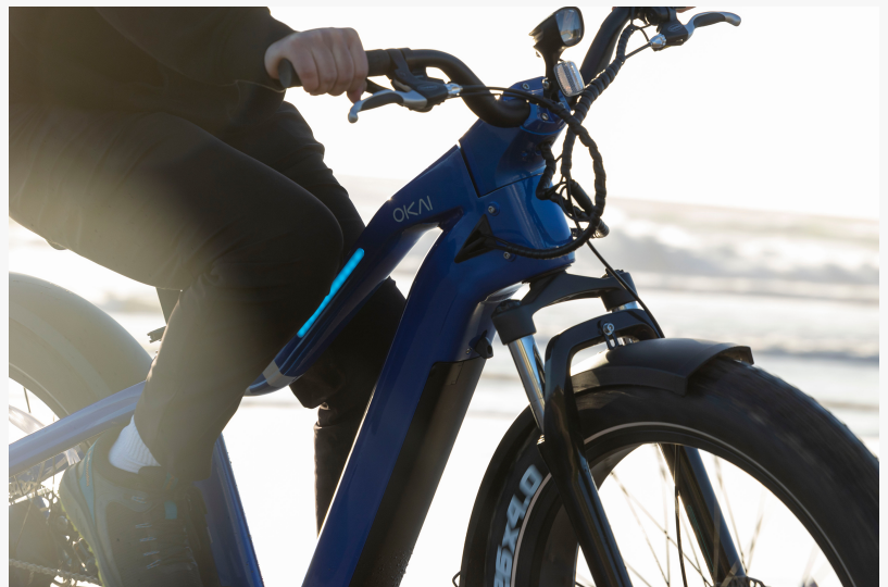
OKAI RANGER customizable ambient light