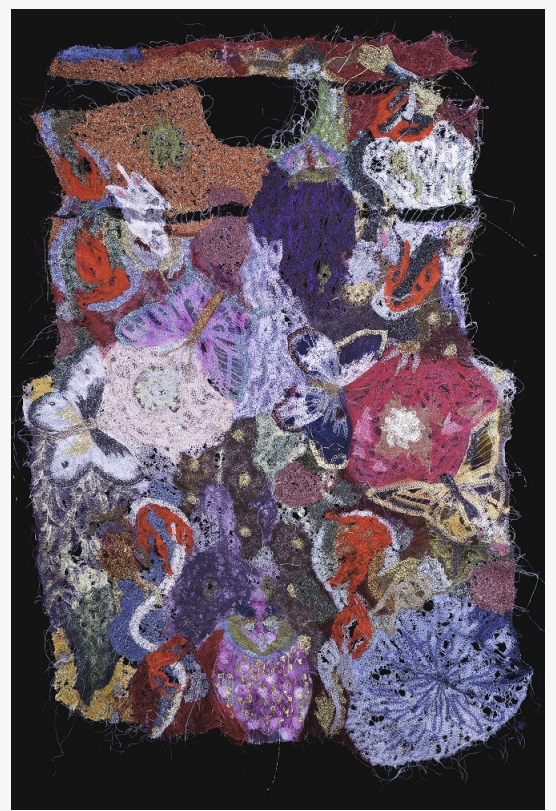
Love for all things shirt yoke collar back