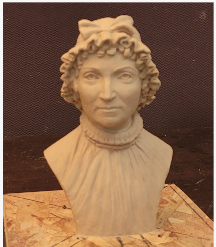
Abigail Adams Clay Statue