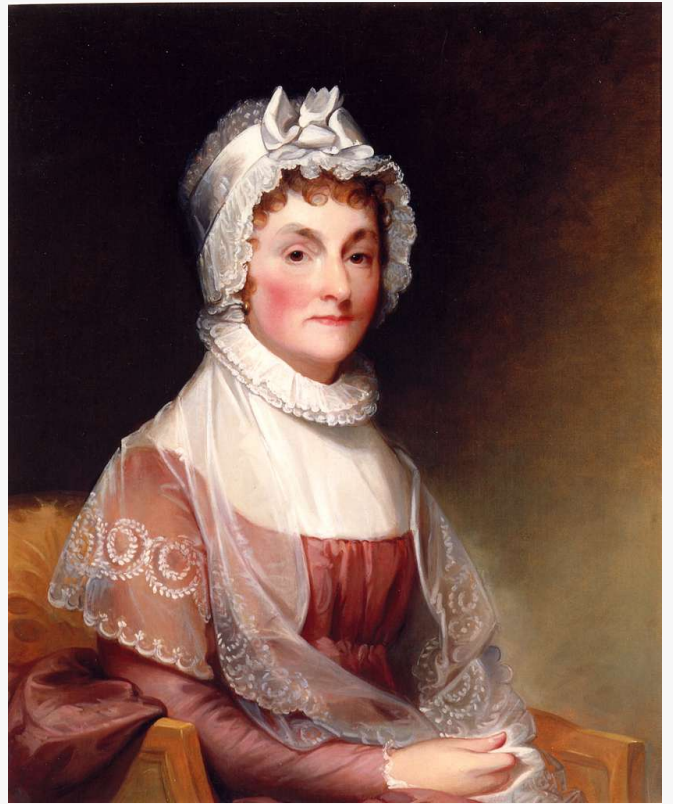
Abigail Adams by Jane Stuart after Gilbert Stuart , C. 1800

“After three decades of creating and manufacturing sculptures for buyers around the world, it’s time to celebrate Her Story Through Sculpture! Each bust will amplify the