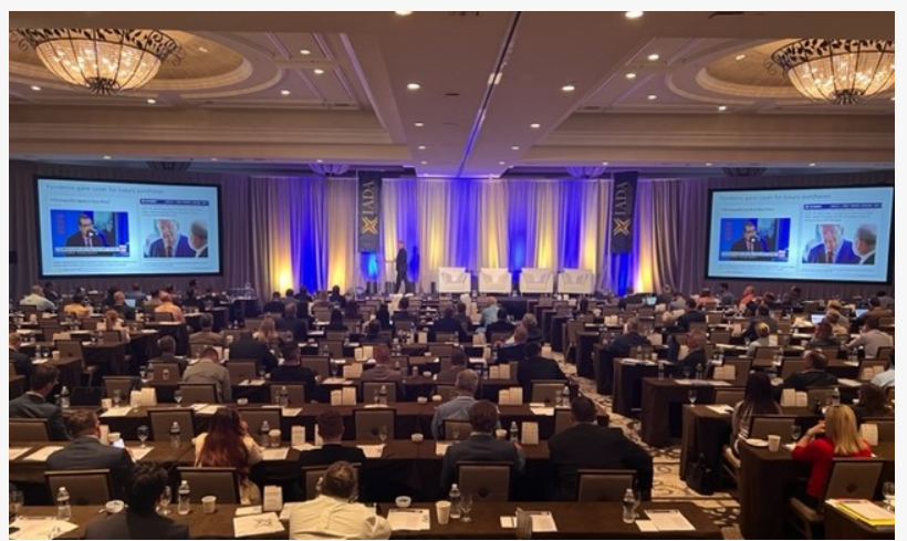
IADA Spring Meeting, Dana Point, Calif.

Spurred on by attractive programs and its members' professionalism in an erratic airplane marketplace, during the past 18 months IADA has added an international OEM and signed up six new IADA-Accredited dealer members and 21 Verified Products and Services members.