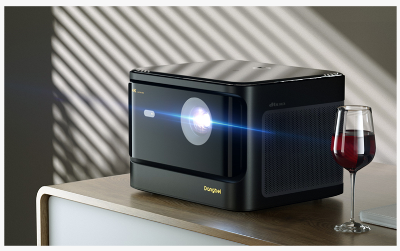
Dangebi Mars Pro 4K laser projector

There are many types of screens on the market, including glass beads, metal, PVC, etc.