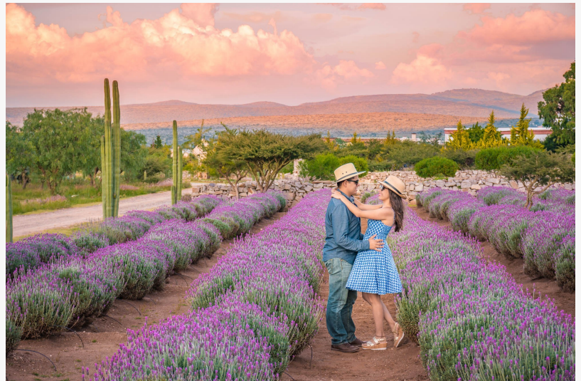
Guanajuato state is known for its magical settings and romantic venues