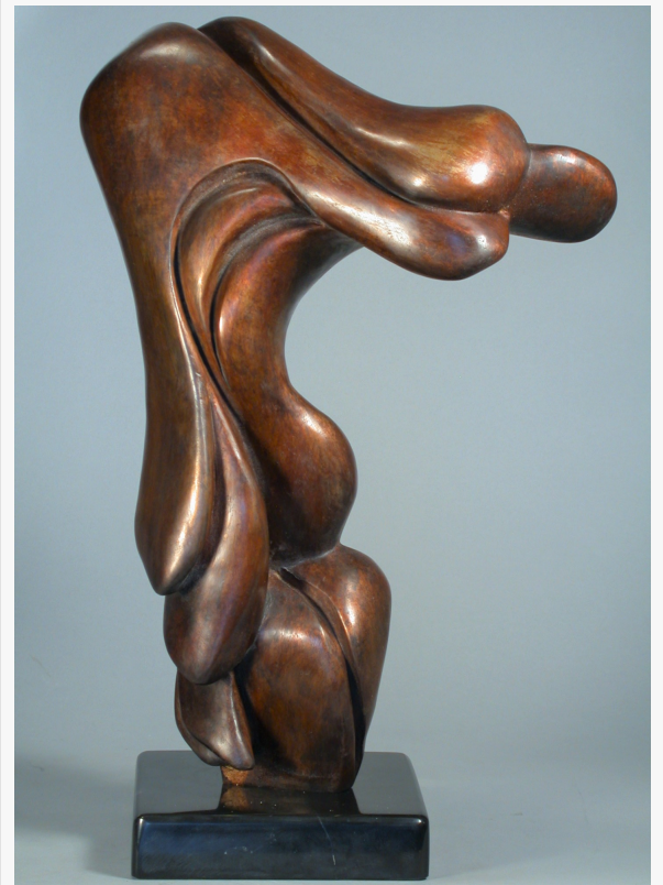
# 444 Fille de joie