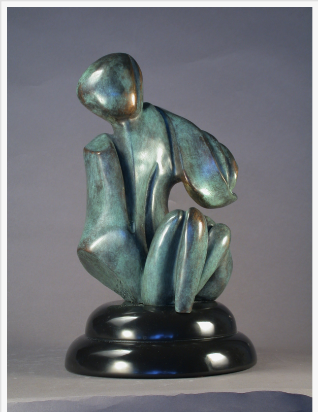
# 420 Notorious

"It is tough not to be influenced. I met many of the greatest sculptors of the 60s, 70s, and 80s, and yes I was influenced by them, but not anymore. I constantly need to be very careful and