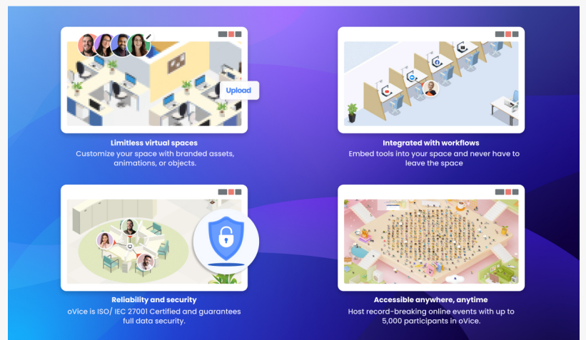
Benefits of using oVice virtual spaces