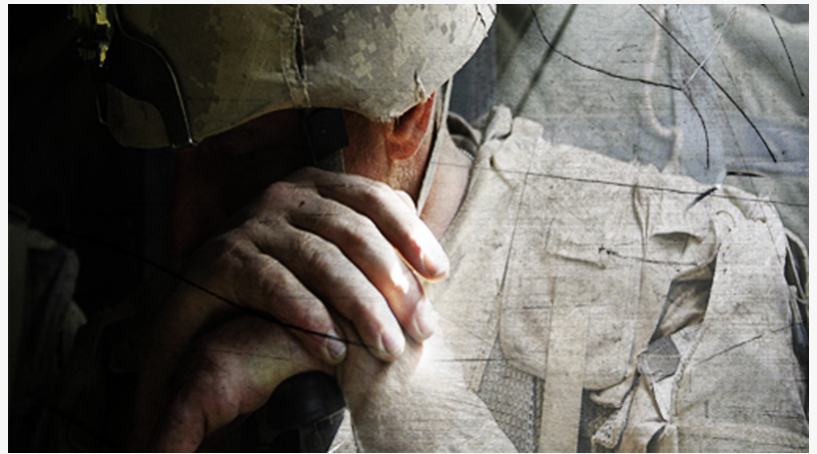
Approximately 20 veterans a day take their own lives, and veterans accounted for 14 percent of all adult suicide deaths in the U.S. in 2016