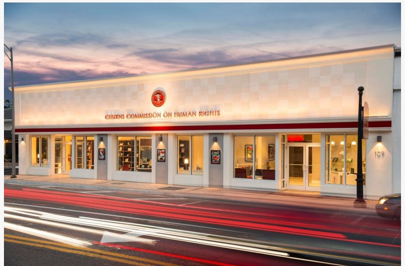
The headquarters for CCHR Florida are located in downtown Clearwater.