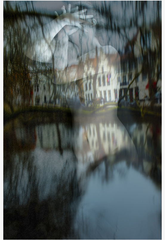
The Tendrils of our Minds

This press release can be viewed online at: https://www.einpresswire.com/article/579885526