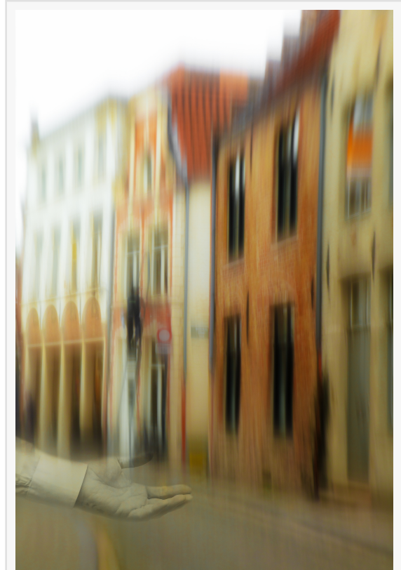
In Case We Fall

To learn more about this artist, please visit http://www.coastalphotography.co.uk/