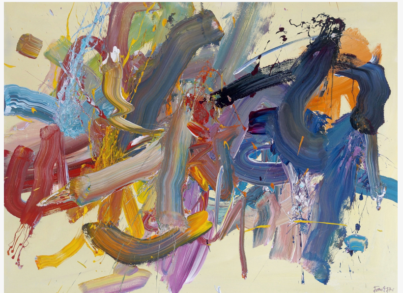
Tune of the Season

To learn more about this artist, please visit http://www.fongfai.com/