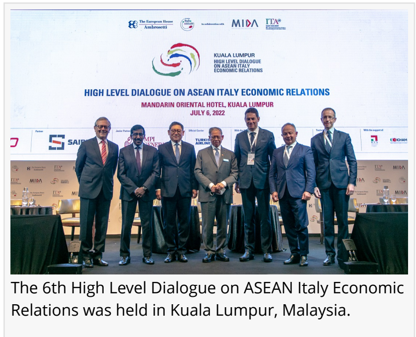
The 6th High Level Dialogue on ASEAN Italy Economic Relations was held in Kuala Lumpur, Malaysia.

KUALA LUMPUR, MALAYSIA, July 6, 2022 /EINPresswire.com/ -- The High Level Dialogue on ASEAN Italy Economic Relations – organised by The European House – Ambrosetti and Associazione Italia – ASEAN, chaired by former Italian Prime Minister Romano Prodi - and in collaboration with the Malaysian Investment Development Authority (MIDA) and Italian Trade Agency (ITA), took place on 6 July at the Mandarin Oriental Hotel in Kuala Lumpur. This convention is endorsed by the Italian Ministry of Foreign Affairs and International Cooperation and Confindustria (General Confederation of Italian Industry).