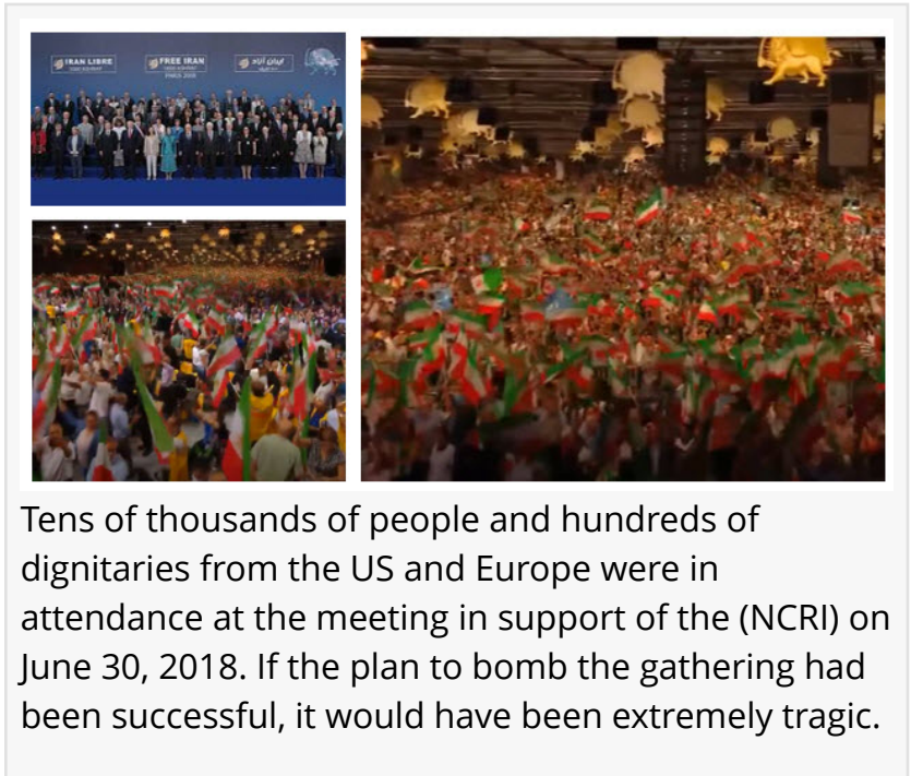
Tens of thousands of people and hundreds of dignitaries from the US and Europe were in attendance at the meeting in support of the (NCRI) on June 30, 2018. If the plan to bomb the gathering had been successful, it would have been extremely tragic.