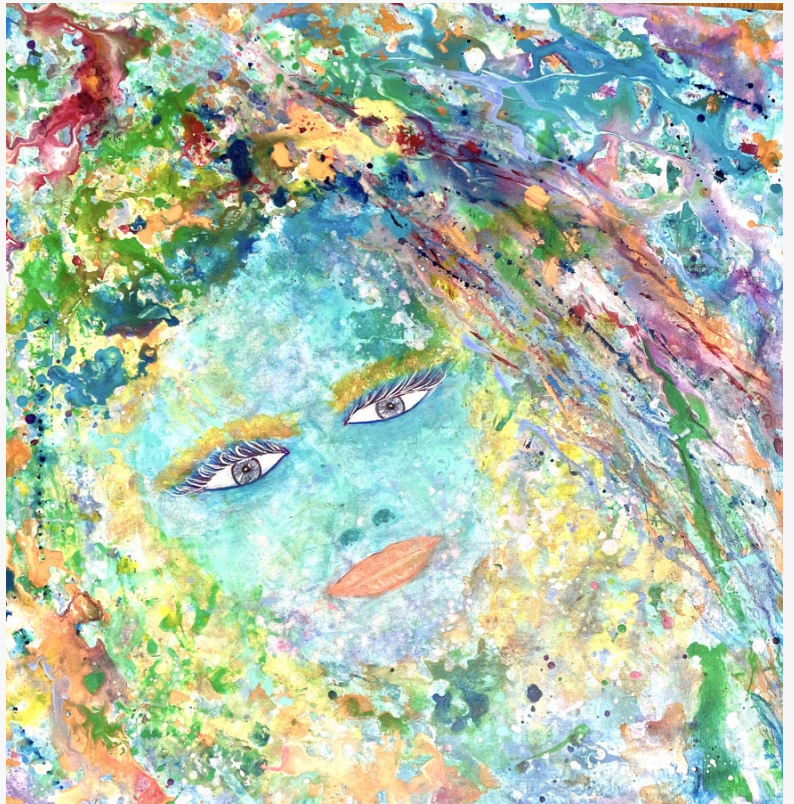
Art of H el ne DeSerres