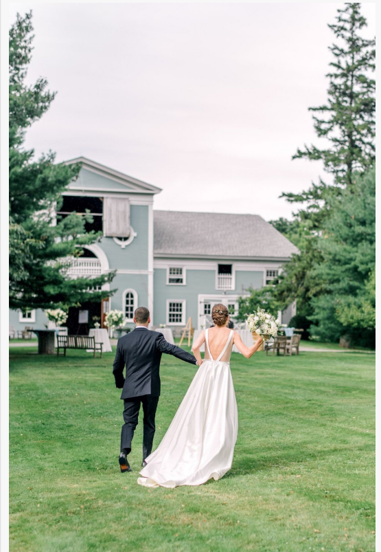
Historic Hudson Valley wedding venue The Hill