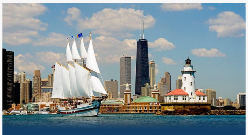
Tall Ship Windy of Chicago, Sailing Into Lake Michigan

Interested investors can receive more information and subscribe to the direct public offering