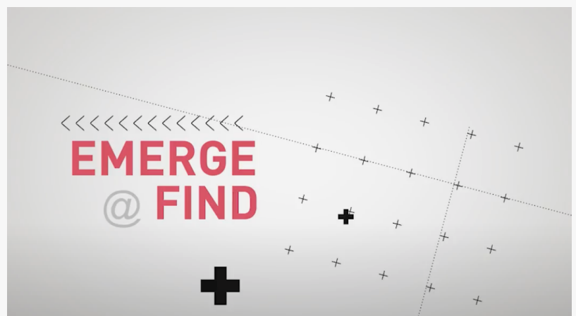
EMERGE @ FIND Trailer