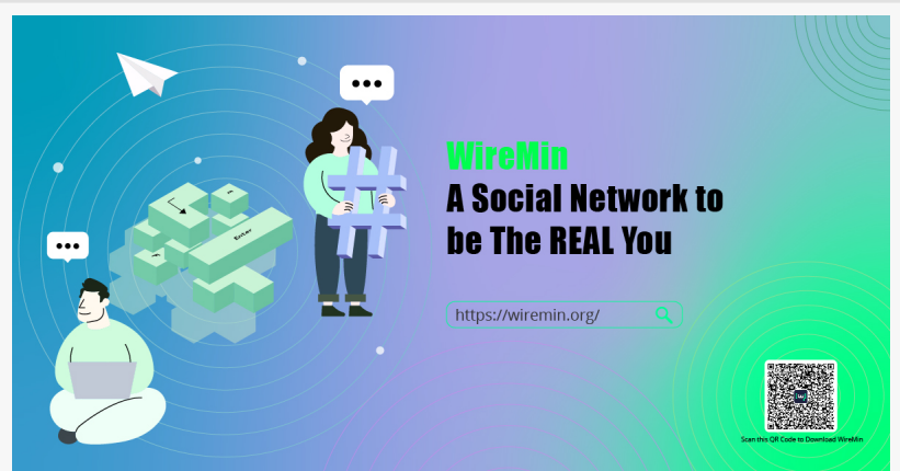
WireMin - A Social Network to be The REAL You

What makes this app unique is its stable and reliable communication foundation. Based on an integration of the latest technologies and protocols, WireMin innovatively leverages a peer-to-