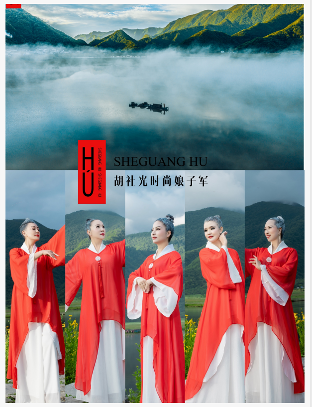
Hu Sheguang Fashion Women's Army at Shennongjia Dajiu Lakes

Each term of Hu Sheguang Fashion Women's Army Summer Camp is three months. Fashion enthusiasts from all over China gather at Dajiu Lakes. Apart from professional courses provided by mentors in fashion, other projects such as fashion campaign photoshoot at Dajiu Lakes popular tourism spots are offered to the members. With the exclusive context of Hu's Aesthetics, it helps Shennongjia Forest District to build ' an internationally famous ecotourism destination'. Meanwhile, the members of Hu's fashion army can pursue their fashion dreams in the spectacular sceneries of Dajiu Lakes.