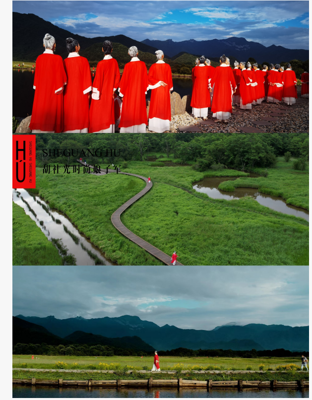
Opening Show 'Spread the Seeds of Love with Filial Piety First'