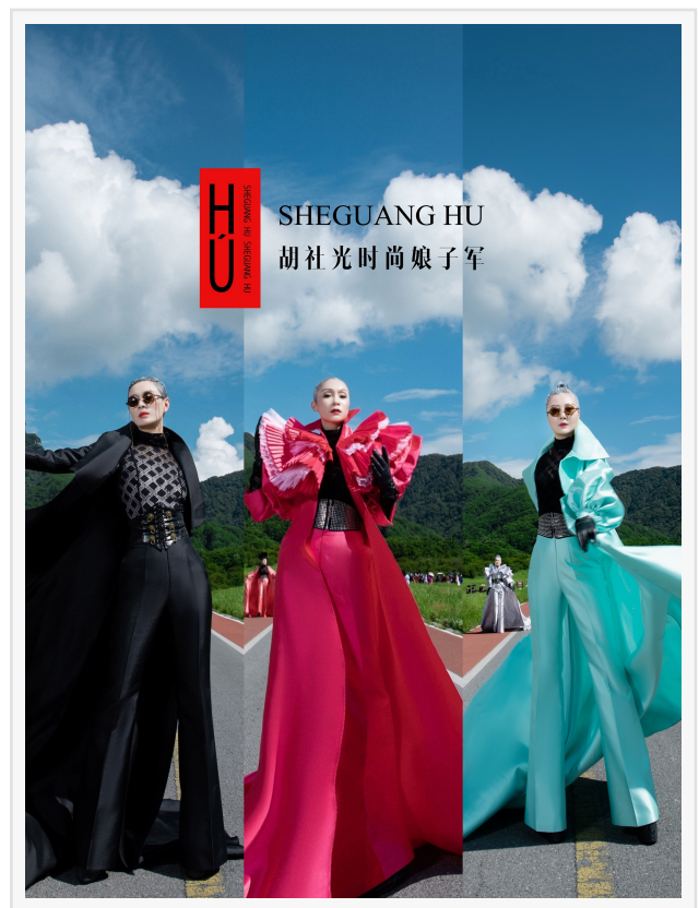
Second Show 'Colorful Dreams'

In the second fashion show, the models changed into colourful outfits. In the natural runway with backdrop of clear water and green mountains, on the heavenly earth, the wonder women of Hu Sheguang's Fashion Army redefined the ultimate meaning of fashion. Hu's Aesthetics once again inspired the fashion world!