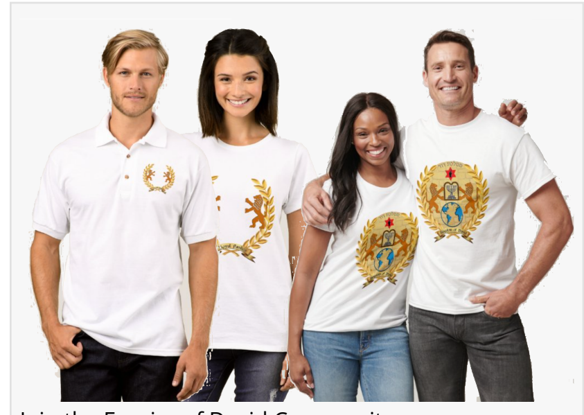
Join the Empire of David Community

While leaders speak about world peace, The world's conflict regions intensify. To the leaders of the world who are nothing more than politicians, world peace and the pursuit of it, is the same as kissing a baby during a campaign. Just another way to get elected, to pull on the heartstrings of their constituents in cynical ways. Ask any politician on this planet what their plan for world peace is? Like a deer dumbed and hypnotized by the headlights of an automobile at night, so will the politician being asked this question, who will have the same bewildered and paralyzed look of a deer caught in a car's headlights.