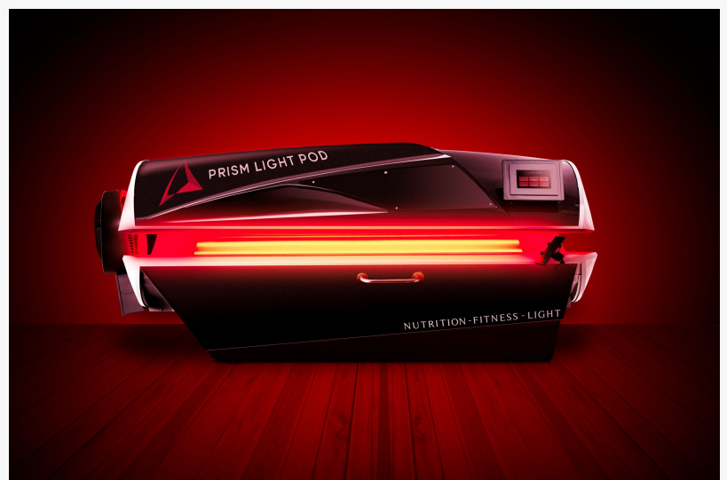
Photo of the Prism Light Pod whole-body red light therapy bed

TAMPA BAY, FL, USA, July 7, 2022 /EINPresswire.com/ -- Cryo-eeze is expanding to a new state of the art holistic wellness center and will be hosting a Grand Opening Event on July 9th. Cryo-eeze biohacking services are backed by scientific research and technology to help individuals enhance performance, reduce chronic pain without the use of prescriptive medications and increase their quality of life.