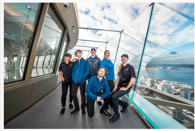
Team members on top of the world on the Observation Deck.

The Space Needle uniform design was inspired by the iconic shape of the building's silhouette. The garment's seams, color blocks, textures, and reflective trims were designed to mirror architectural lines while also flattering the human body. The Space Needle's brand was