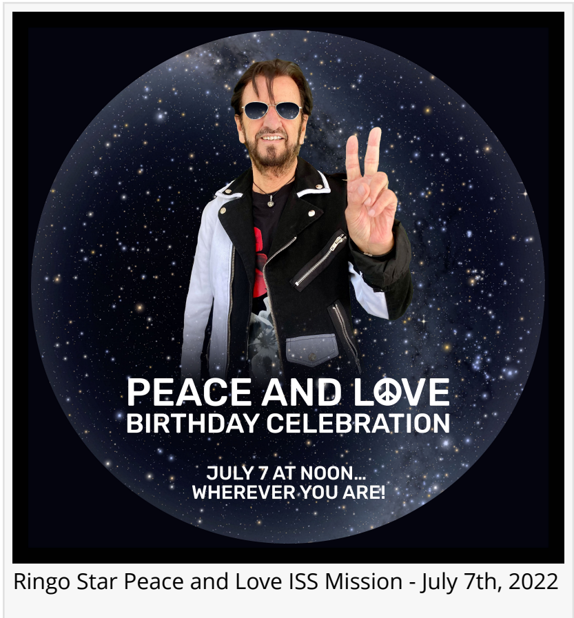
Ringo Star Peace and Love ISS Mission - July 7th, 2022

LOS ANGELES, CALIFORNIA, USA, July 8, 2022 /EINPresswire.com/ -- Ringo Starr's musical messages of Peace and Love were beamed to the International Space Station (ISS) and across the universe through the Artemis Space Network on July 7, 2022 in celebration of his 82nd Birthday. Ringo's ISS "Peace and Love Space Mission" included Ringo's 'Starr Song', created by 'sonifying' the celestial stars over Liverpool the day Ringo was born, and "Let's Change the World", the title cut from his album released in September 2021.